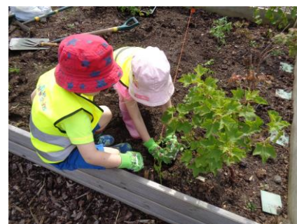
The children helping to maintain the plot at the allotment.